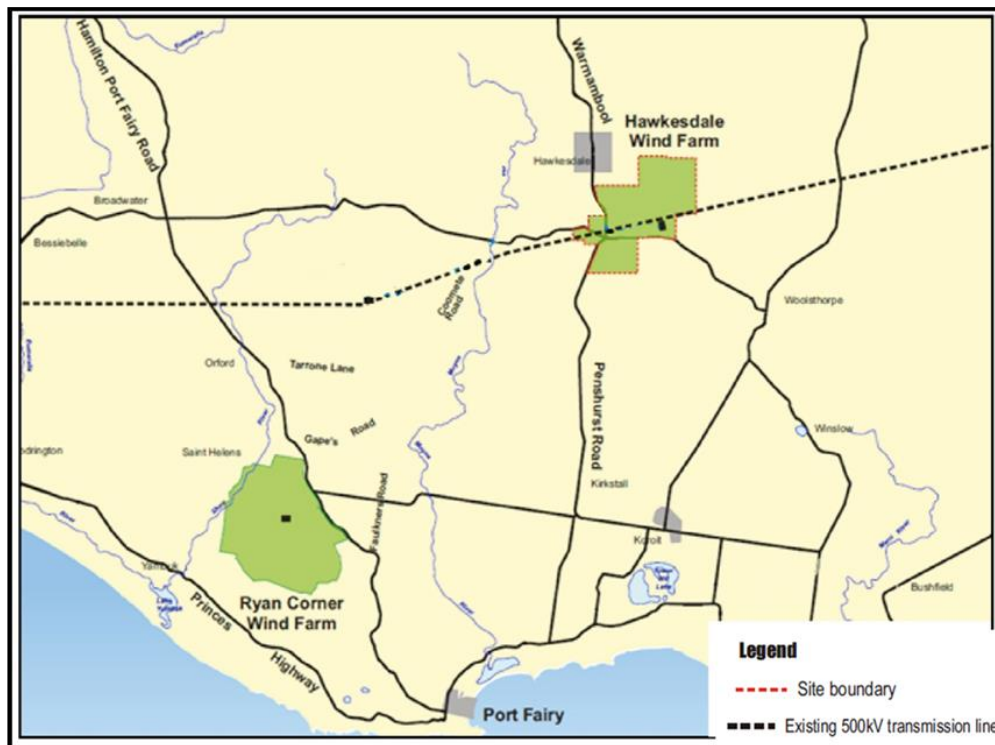
Figure 1.1 Ryan Corner Wind Farm Location

Ryan Corner Wind Farm (the Project) is located approximately 12 km northwest of Port Fairy, in the Shire of Moyne, Victoria (Figure 1.1). The Minister for Planning under Planning Permit No. 20060222 approved Ryan Corner Wind Farm on 21 August 2008. An amendment to the planning permit was most recently issued on 9 March 2022 (Planning Permit No. 20060222-2).