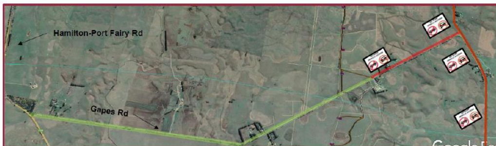
Figure 6 – Gapes Rd Access