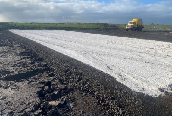
Lime and cement stabilisation on access tracks and hardstands