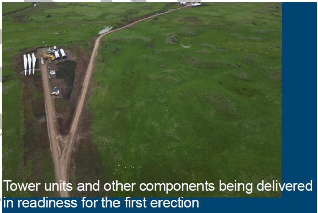
Tower units and other components being delivered in readiness for the first erection