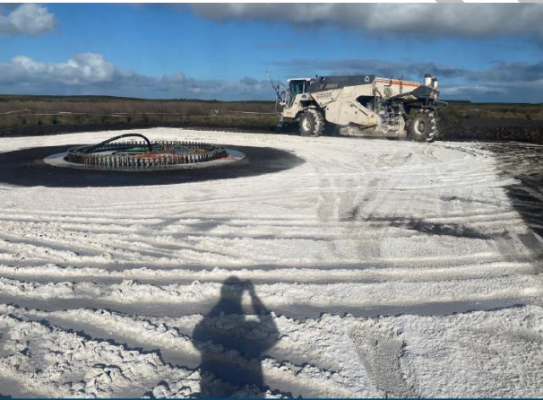
Lime and cement stabilisation on access tracks and hardstands