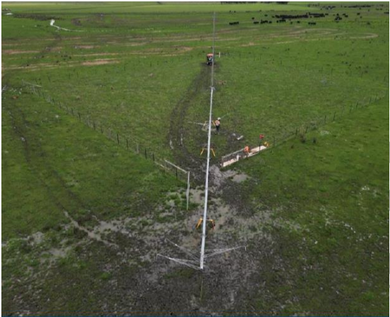
Temporary met masts being removed and permanent ones under manufacturing