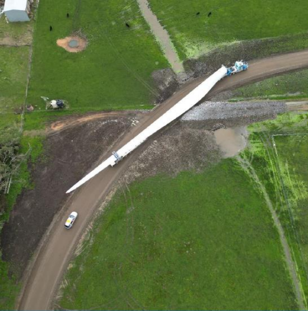
Blade making its way through the site