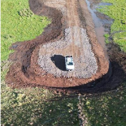
Crane hard stand being excavated and finished